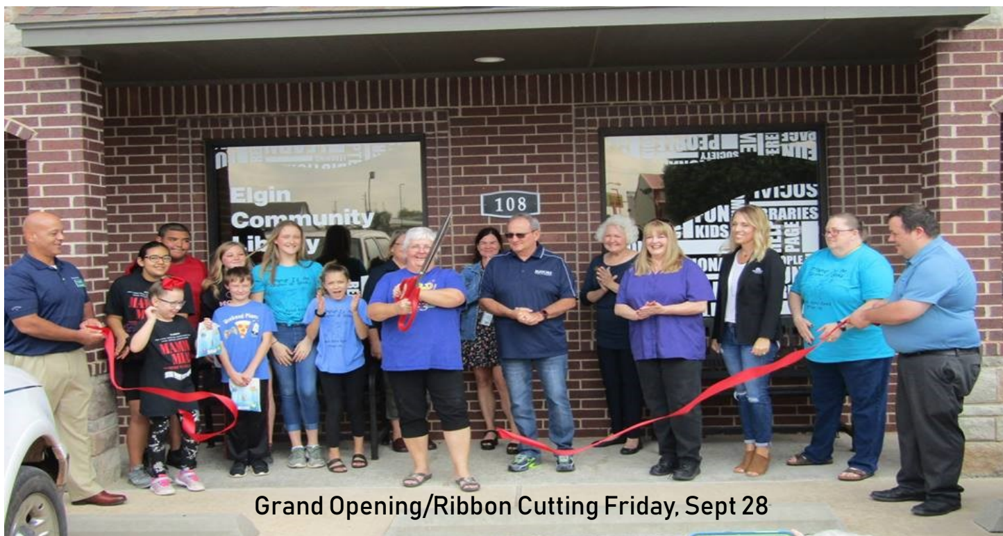
Grand Opening/Ribbon Cutting Friday, Sept 28